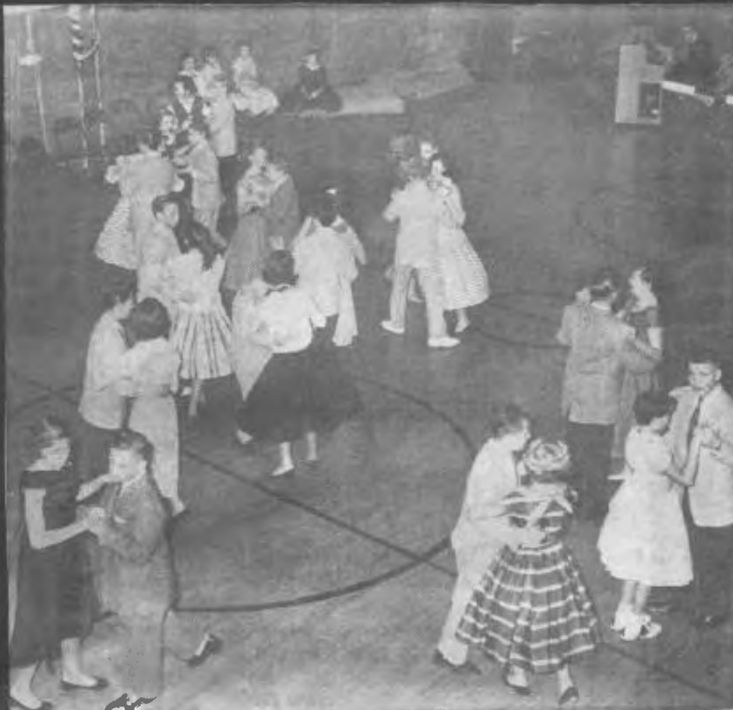
THEY COULD HAVE DANCED all night, but curfew was at 10:30 p. m. for these Wheeling Junior Cotillion club members. The young people are seventh and eighth graders and hold 4 dances each year with instruction