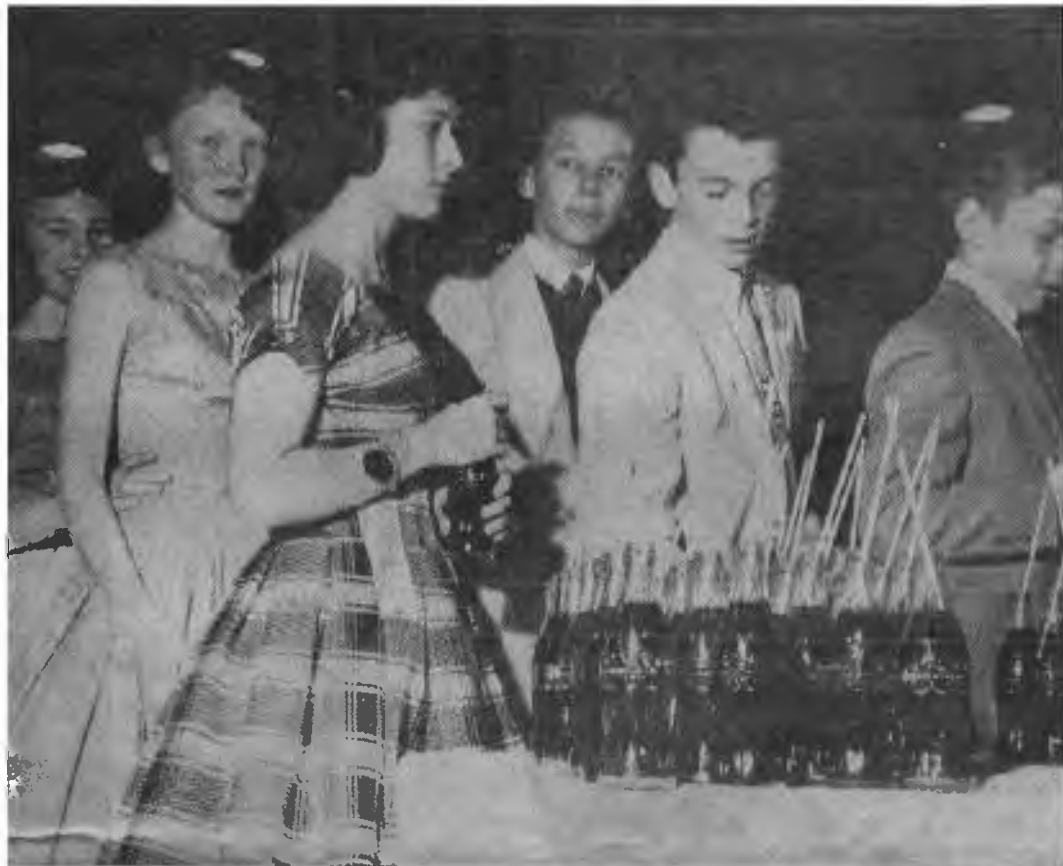
"PAUSE THAT REFRESHES" takes time out from dancing for 70 young people from seventh and eighth grades in Wheeling school at February 15 Junior Cotillion dance. Mu-